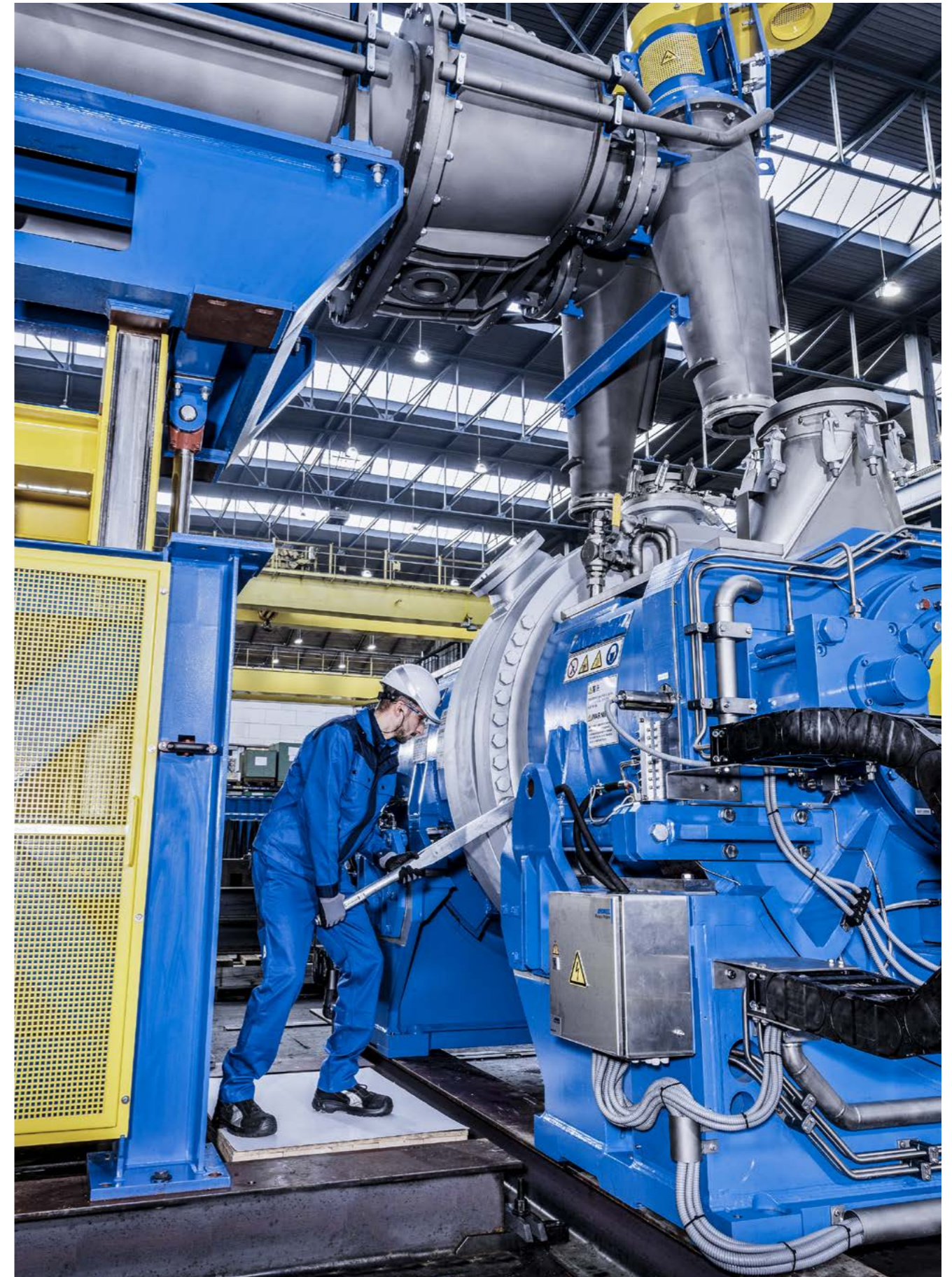
Feeding system lifted for twin refiner opening