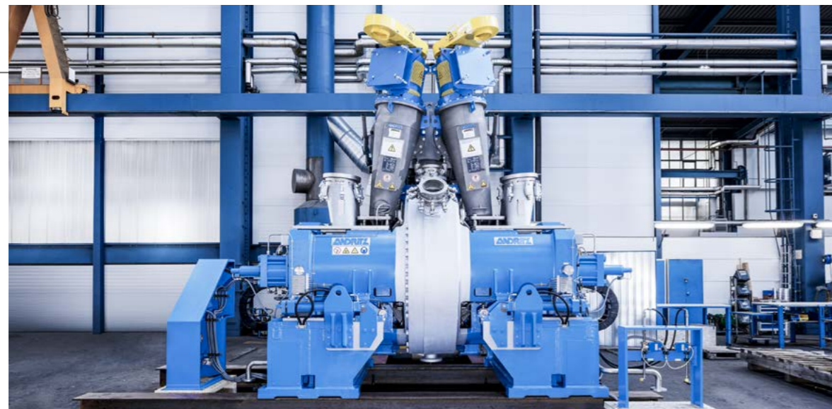
ANDRITZ TX68 refiner with DoubleSEPF (Side Entry Plug Feeder) and C-Feeder (Constant Feeder)